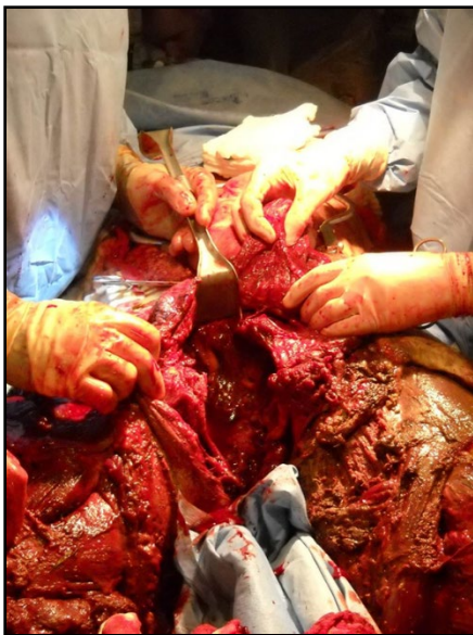
Figure 1. Dismounted Complex Blast Injuries Figure 2. Open Pelvic Ring Injury

Once in the operating room, hemorrhage control in the wound can be accomplished by replacing field TQ with pneumatic TQ. Total TQ time should be recorded, and it is imperative to communicate with anesthesia when the TQs are being released. These patients can have profound hypotension when the TQs are released and anesthesia must be ready with blood, calcium, bicarb and be prepared to hyperventilate the patient to manage the large acid load from reperfusion of the ischemic limb as inflow is restored. It is important to note that examination of the pelvic ring should be performed to address stability. Pelvic fractures can be stabilized with the use of clamped sheets or commercial pelvic binders centered over the greater trochanters, or a pelvic external fixator if resources and ability allow for this.